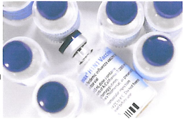
Swine flu inquiries may expose employers to discrimination lawsuits, according to legal experts.

In addition, attorneys say, employers are permitted to send employees home if they're showing symptoms of the flu and are allowed to ask them to stay home for three to seven days, as recommended by the CDC in Atlanta—or as long as necessary to complete treatment, such as antiviral medication.